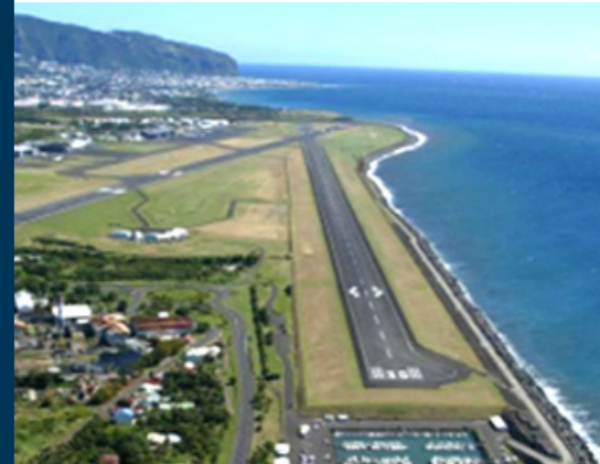
ROLAND GARROS AIRPORT, REUNION ISLAND Runway rehabilitation (ADPi & Artelia)