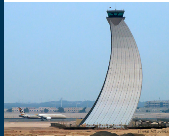
ABU DHABI, UNITED ARAB EMIRATES Air Traffic Control Tower