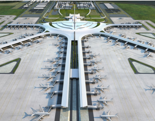
BULACAN INTERNATIONAL AIRPORT - PHILIPPINES Airport Planning and Functional Architecture