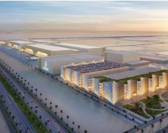
AL MAKTOUM INTERNATIONAL AIRPORT, UAE 5 triple-bay MRO hangars, 3 paint hangars