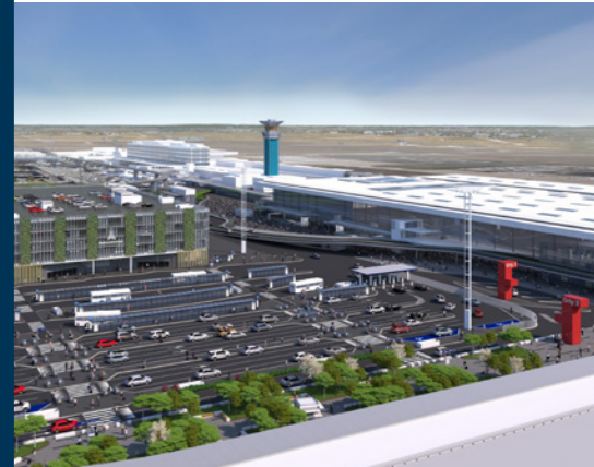
PARIS - ORLY AIRPORT, FRANCE "Orly" metro station