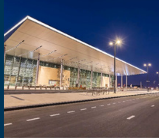
BAHRAIN AIRPORT, KINGDOM OF BAHRAIN New PTB, roads, car parks, BHS, fire fighting station