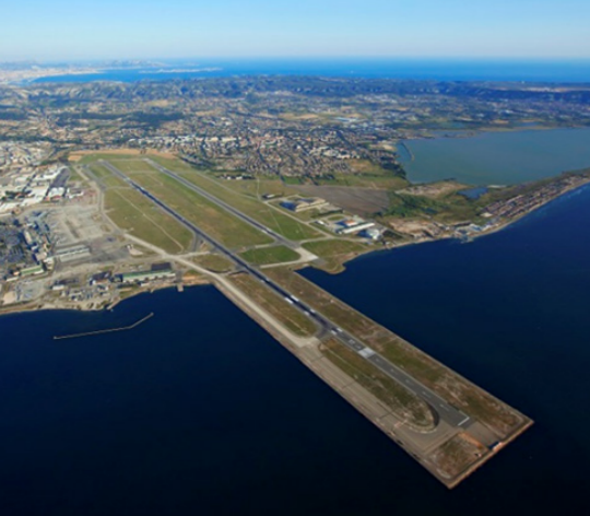
MARSEILLE PROVENCE AIRPORT, FRANCE Net zero carbon & energy self-sufficiency