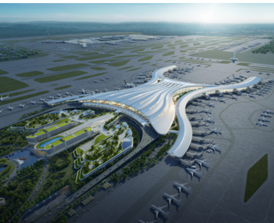
GUANGZHOU BAIYUN AIRPORT, CHINA New Terminal 3